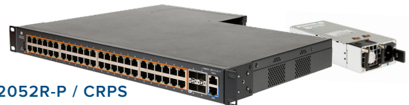
EX2052R-P / CRPS